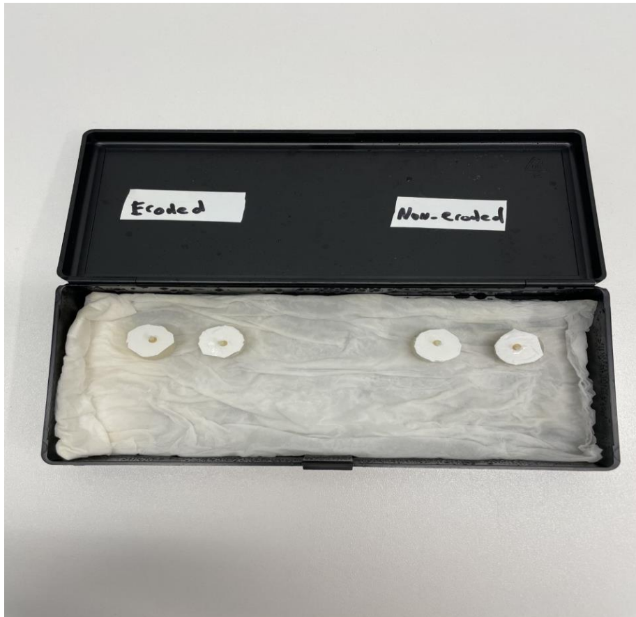
Figure 4: Isolation through black box