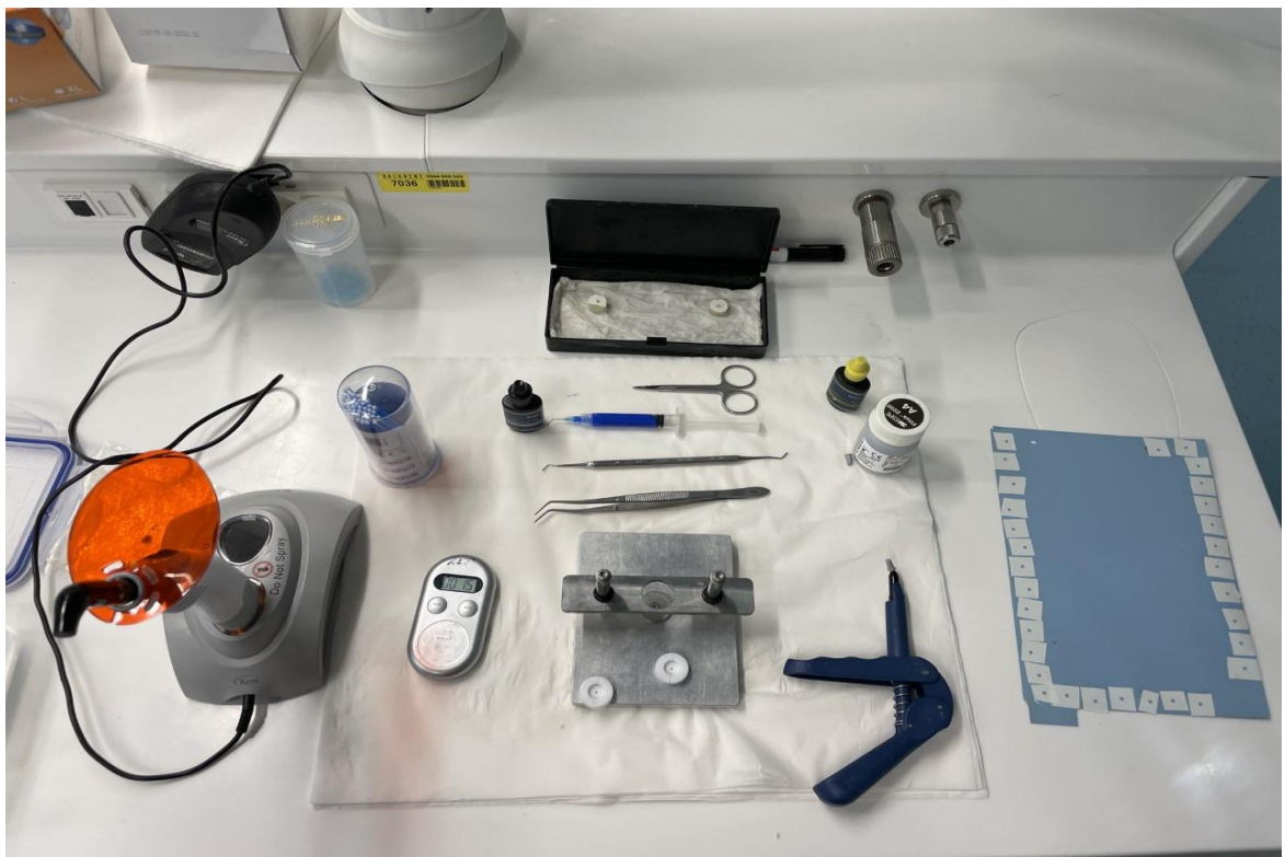
Figure 3: Set up for the experimental procedure

standardized bonding area. For the restoration, the dentine specimens were etched for 15s with the phosphoric acid according to each experimental group (Table 1), then they were rinsed with water spray for 15 s and slightly airdried for 5 s. Subsequently, the adhesive system (OptiBond FL, Kerr) was applied according to the manufacturer's instructions. Firstly, the OptiBond FL Prime was applied with a microbrush, lightly scrubbing for 15 s followed by gently air-dried for 5 s. Next, the OptiBond FL Adhesive was applied also with a microbrush, creating a thin coating and light cured for 10 s (LED curing unit; Demi, Kerr; power density of 1500 mW/cm 2 ). For the restorative procedure, a split Teflon mold was fixed on the dentine surfaces (inner diameter 1.5 mm, bonding area 2 mm 2 , height 2 mm) and filled with composite resin (Filtek Z250, 3M ESPE, shade A4). The composite was light cured for 20 s (LED curing unit; Demi, Kerr). The specimens were straight placed in black light-tight boxes (Figure 4) to avoid any further influence of ambient light, and then kept in an incubator (UM 500, Memmert) at 37°C and 100% humidity. After 24 h, the specimens were subjected to SBS testing.