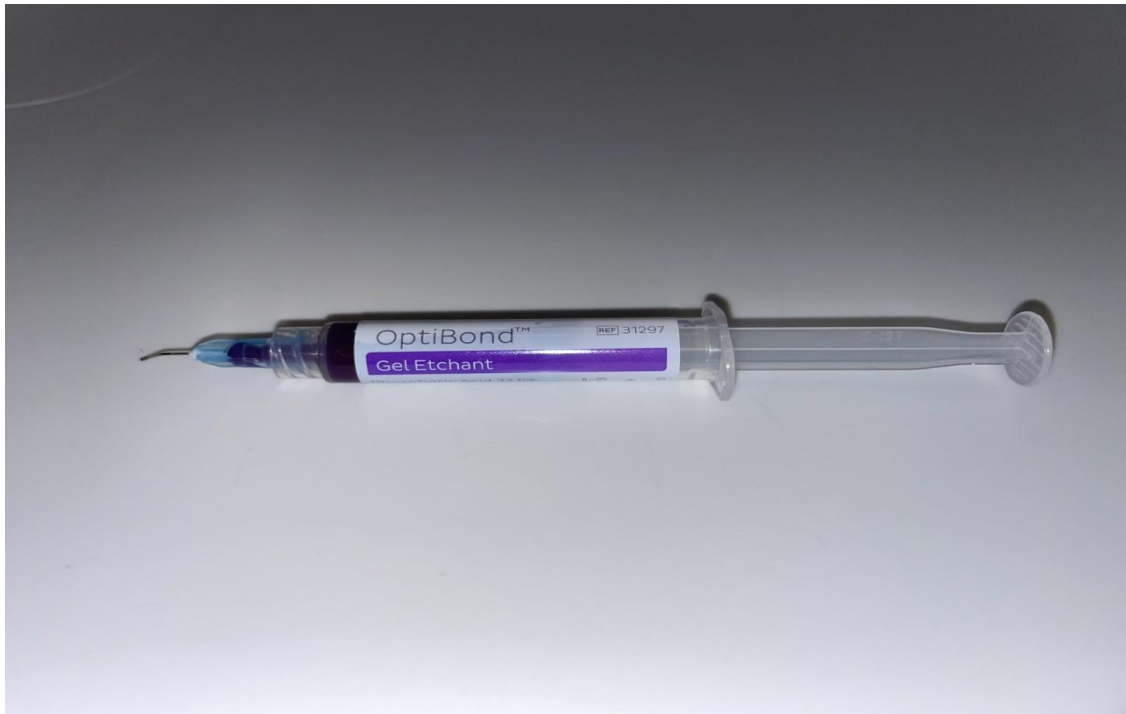
Figure 2, Kerr commercial phosphoric acid