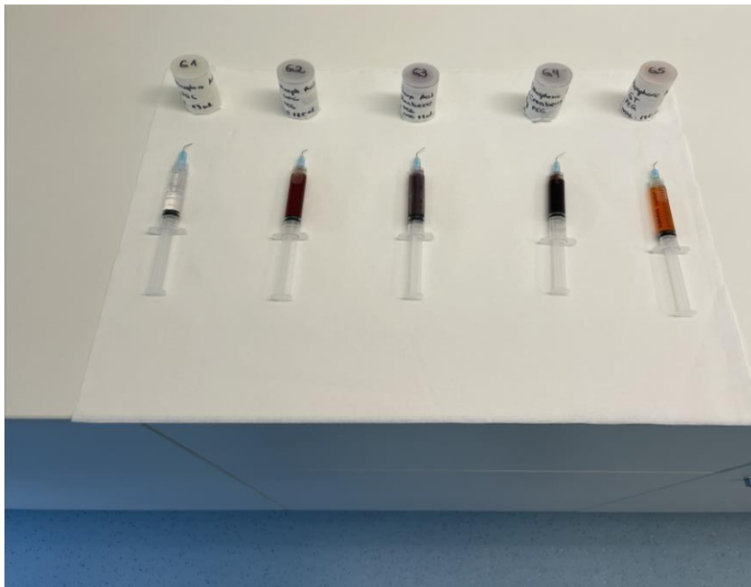
Figure 1 : 5 MPA groups

A solution of phosphoric acid (37%) was prepared in the laboratory and, from that, a total of 5 MPA groups (Table 1) were developed. One group, the negative control, contained no polyphenols, and the other 4 groups contained 2% of polyphenol-rich extract: Grape seed extract; Blueberry extract; Cranberry extract; Green tea. The 5 MPA groups were gelled by adding polyethylene glycol (Figure 1), as used in some commercialized acids. In addition, a commercially available phosphoric acid (OptiBond Gel Etchant, Kerr, 37.5% phosphoric acid) was also tested, as positive control (Figure 2).