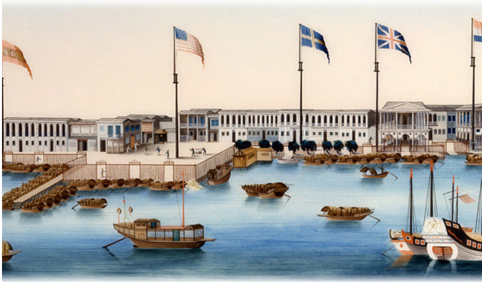
Illustration 1: Canton's Fanqui-town

Ghosh has a blog on his website, where he has dedicated one page to Canton's old foreign enclave. 107 The uncredited painting below is not described in the novel, but it gives a good impression of Canton's Thirteen Factories: