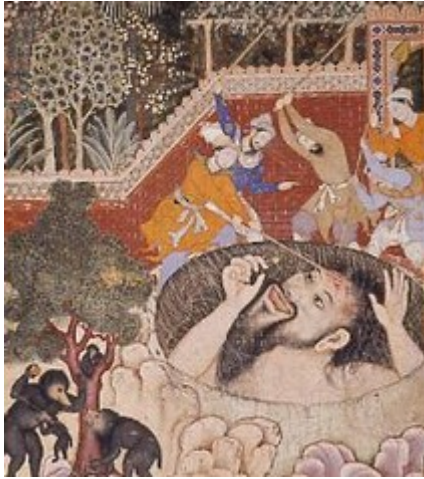
Illustration 3: an excerpt of the Hamzanama 155